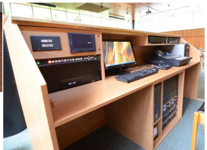
Pictures showing a 60" platform-facing display for service leaders and musicians, foyer LCD with relay/signage capability and the main console housing all AV equipment

A new bespoke console houses all tactile equipment including a Kramer switching-scaler (visual source switching), Pioneer bluray player, Kramer touch panel (screen and projector control) and Datavideo camera/bluray preview monitor. An AV-optimised PC was built especially for the system to reliably run service management software and Powerpoint displays. The current Church sound system was reintegrated into the console to work seamlessly with the visual system.