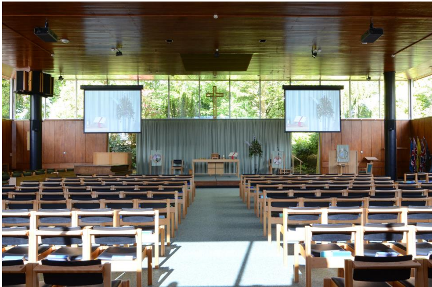
The main church showing dual winched projection screens and 7000 lumen Eiki projectors for high image quality in daylight conditions

At Reigate Park Church, Creative Audio-Visual Solutions were commissioned to install a high quality visual projection system capable of clear images in the very high ambient conditions within the Church. The system also needed to have a little impact on the Church aesthetically. Two dual winched projection screens allow the casings to rise close to the ceiling when in use, via touch panel control. Two Eiki 7000 lumen projectors show all images with superb clarity from all sources. The system is based on a fully digital HDMI infrastructure – further increasing image quality and long term capability with HD sources and HDCP-licensed material (bluray etc.). A Sony remote camera provides images from activities anywhere in the main Church to be projected and recorded onto DVD as well as fed to relay displays in the foyer and adjacent hall. These displays feature local connectivity for independent meetings.